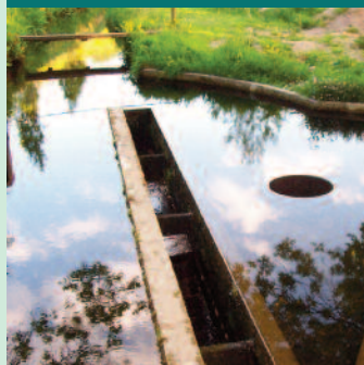
Settlement tank and flood water spillway