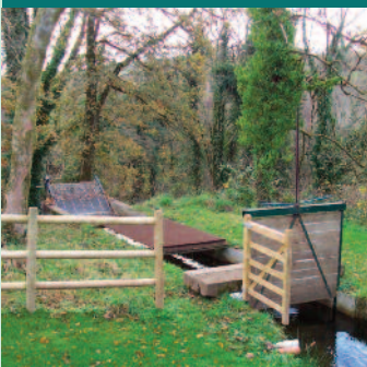
Automatic fish protection and debris screen